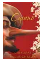
Art Direction and Design for Cyrano