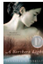
Art Direction and Design for A Northern Light