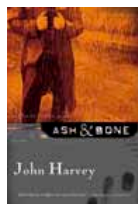
Art Direction and Design for Ash & Bone