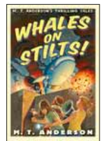
Art Direction and Design for Whales on Stilts